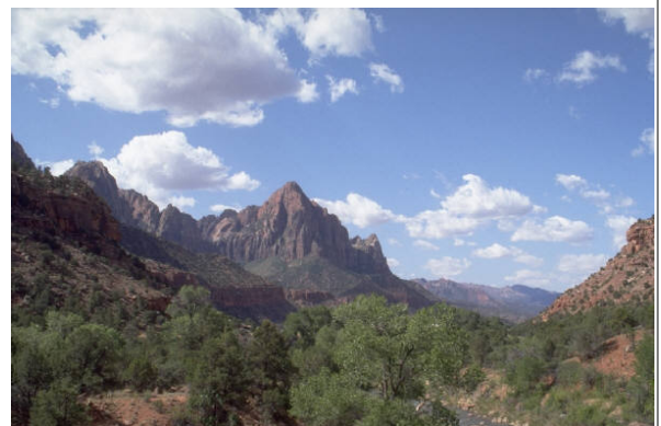
Forests and rangelands provide unique habitat in the intermountain west region of the United States.

New program trains realtor on forestry and encourages them to distribute packets to individuals purchasing rural land. Packets contain information on active forest management, tree identification, and who to contact.