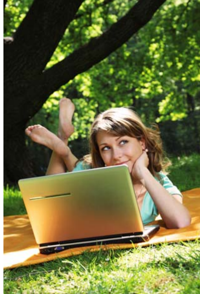
Trees and forests provide many benefits to urban and rural residents. Photo courtesy of Stockphoto. All rights reserved.

results cannot be generalized to the U.S. population as a whole, results indicate forests are important to Americans in a number of ways and they have multiple concerns about the future of forests. Participants consider forests important for many reasons, including spiritual values, physical and psychological health continued page 2